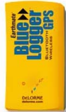
Actual size 1.75" x 3.25" x 0.75"

The pocket-sized Blue Logger is also a powerful standalone data collector. Simply turn it on and, as soon as it picks up a GPS fix, it will begin to record its location, speed, and more, at a distance or time interval that is established using the included Blue Logger Manager software. The collected data is downloaded wirelessly in one of a number of formats and can be easily imported, displayed, and managed in XMap.